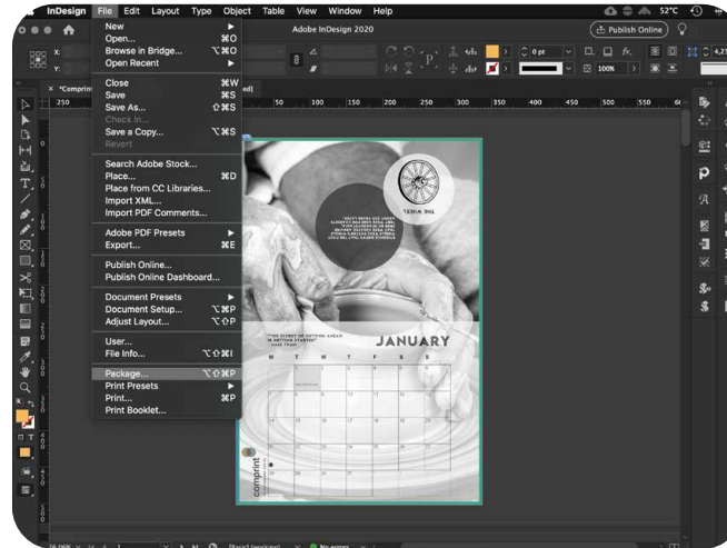
STEP 1 – Click File > Package > Click “Package”

Once the file has been packaged and saved, right click on the folder > Click “Compress” to ZIP the file > Send the WeTransfer File to us