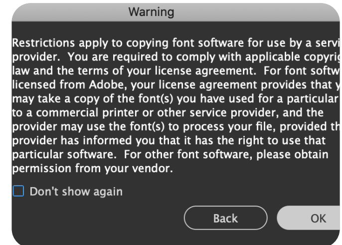
STEP 4 – Click “Ok”